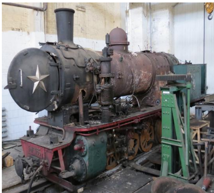
The 750mm gauge Gr-185 0-8-0 from the Rostov children's railway under repair at Tikhoretzkaya, stripped down and awaiting a new boiler.

The working life of most steam locomotive boilers in Russia has long expired. New replacement boilers are planned to be ordered from Europe. While being costly, this is the easier side of the situation. The legal background so far lags far behind...