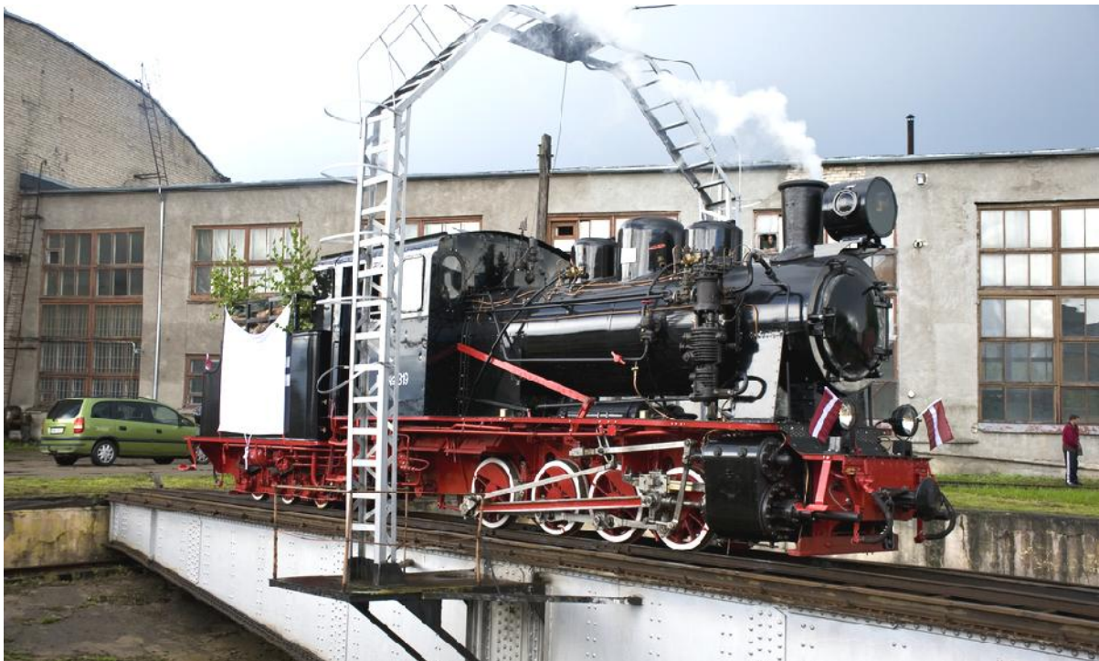
The newly-restored and about-to-be-named Ferdinands of the Banitis line in Latvia awaits its inauguration (see p.5 )